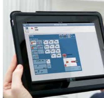
Remotely manage your POC devices with your tablet.

You can't be everywhere—all of the time—and now you don't have to be. With the RAPIDComm Web Application, you can quickly view the status of your POC instruments and troubleshoot issues—even from a hand-held device. For blood-gas analyzers, you can even remotely view and control instruments, regardless of where they are located or wherever your busy day takes you.