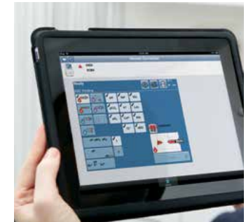
Remotely manage your POC devices with your tablet.

You can't be everywhere—all of the time—and now you don't have to be. With the RAPIDComm Web Application, you can quickly view the status of your POC instruments and troubleshoot issues—even from a hand-held device. For blood-gas analyzers, you can even remotely view and control instruments, regardless of where they are located or wherever your busy day takes you.